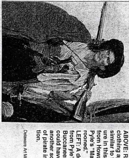
ABOVE: Rip clothing is similar to that of a pirate in this from Howard Pyle's "Marooned."